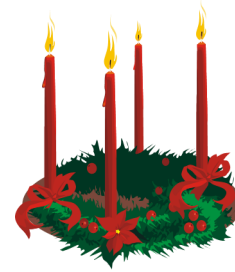
Getting ready for Christmas