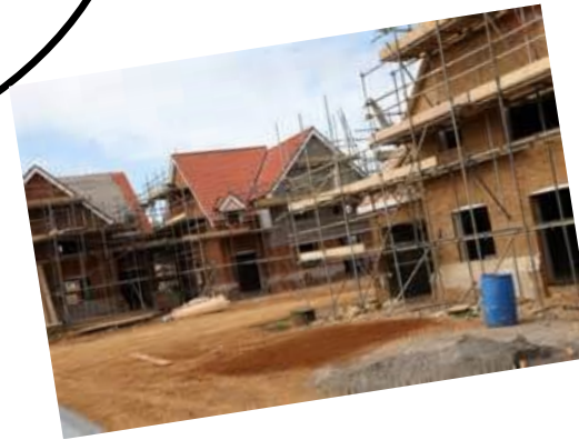
Designing and building a model home